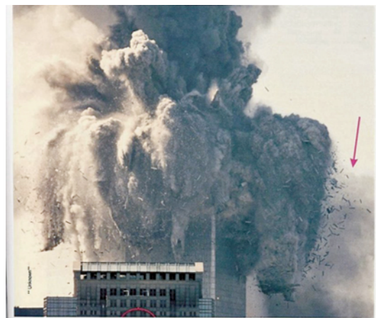
Figure 5-29 The tower is 63 meters (207 ft) wide. The red arrow points to pieces of the tower that have been thrown at least 70 meters. Why didn't the pieces simply fall down? Why were they ejected with such force?